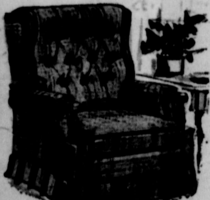
COLONIAL STYLE 3-WAY RECLINER. ... $99.50