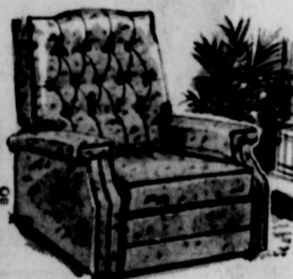
DIAMOND TUFTED BACK RECLINER. .... $69.50