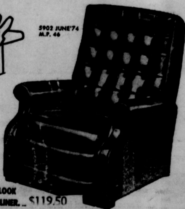
LEATHER-LOOK VINYL RECLINER. ... $119.50

Give Dad something to relax in... a lounge or recliner chair! There are styles to fit any decor and to suit any Father.