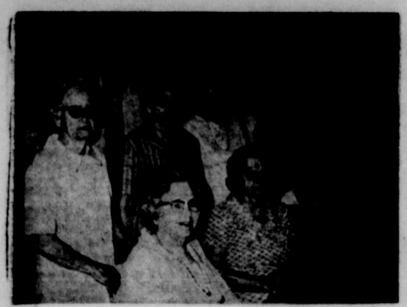
. . . Leeth Family Descendants.