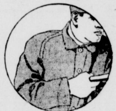
Shoulder and sleeve all in one piece—this is a special Blue Buckle feature. This takes up the strain that normally comes on the shoulder and assures ease and comfort.

Ask your dealer for a pair today—Men's, Youths' and Children's sizes.