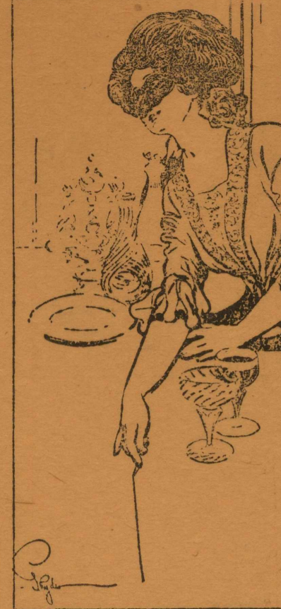
She deliberately drew a line across the center of the table.

"Signora, dinner is served," the maid announced. "Signora!" thought Hillard. "After you, Mr. Hillard," she said.