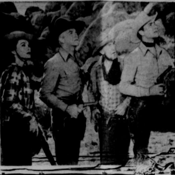
in "IN OLD COLORADO" with another feature attraction, your favorite cartoon "LFL ABNER" at the Palace Theatre, Friday and Saturday, March 7th and 8th.