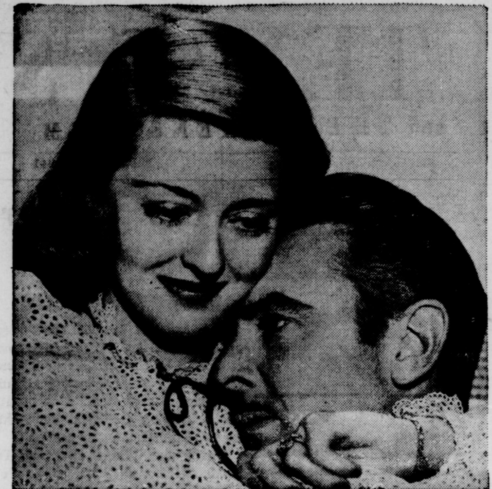
Playing at the Palace Theatre, Wednesday and Thursday in "The Great Lie" another stirring