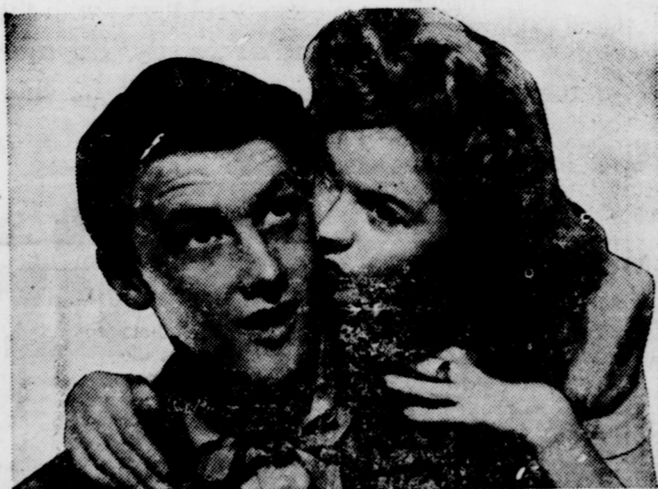
Shirley Temple starts the tongues awaggin' when she's caught kissing Jerome Courtland in this scene from Columbia's "Kiss and Tell."