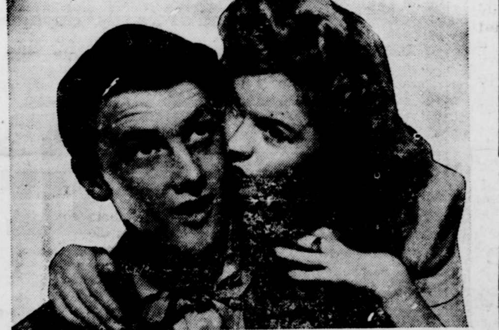
Shirley Temple stars the tongues awaggin' when she's caught kissing Jerome Courtland in this scene from Columbia's "Kiss and Tell."