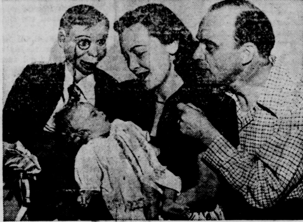
CHARLIE MINDS THE BABY — Charlie McCarthy is trying very hard not to be jealous of the new baby, Candice Bergen, shown here in a glamorous nightie, with her parents, Mr. and Mrs. Edgar Bergen. Charlie has promised to mind—and even entertain—the baby while they're on vacation this summer.

Just in case your grocer has any sugar, spare stamp No. 51 is good for five pounds for regular table use, since September 1. OPA said the stamp would remain valid until December 31. Spare stamp 49 will continue good through September 30.