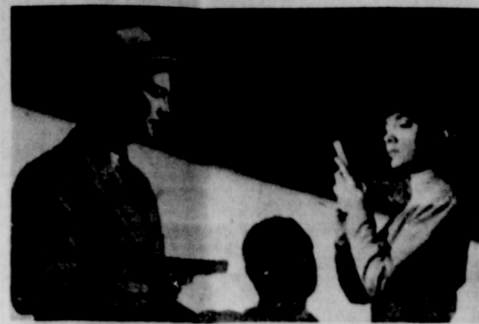
ROBERT TAYLOR and AUDREY TOTTER grill a murder suspect. A scene from MGM's 'HIGH WALL' co-starring HERBERT MARSHALL.