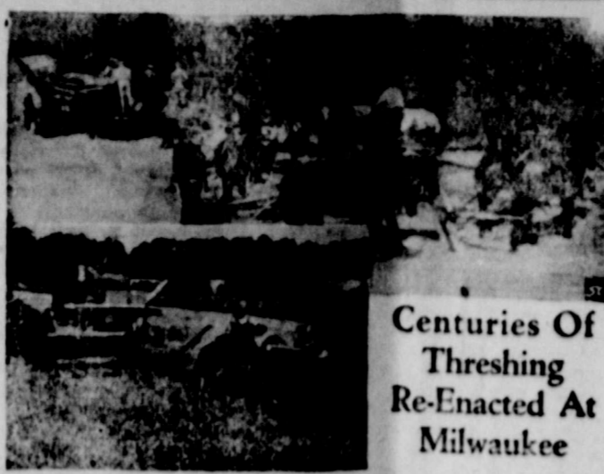
Centuries Of Threshing Re-Enacted At Milwaukee

QUESTIONS AND ANSWERS Q—What is the deadline for reinstatement of lapsed National Service Life Insurance on a comparative health basis? A—July 31, 1948, is the last day to make application for policies which have lapsed for more