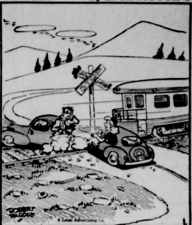
"Oh, that's O. K. Honey, SPUR MOTOR CO. can make it good as new."

PIANOS KIMBALL, GULBRANSEN SPINETS Good used grand and uprights. Refinished and guaranteed TERMS Broach Music Co. Abilene, Texas 1081 So. 1st St. Ph. 2-1143