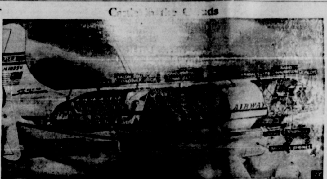
Here's an "Angel's Eye" view of the most luxurious thing a-ving, the new Clipper America of Pan American World Airways' ever-green fleet. A double-deck plane of movement, which has never been available before. With lounge, bar, berths and chef-cooked meals, there is a stability about it in the air that completely relaxes the passenger. Its first flight will be between San Francisco and Honolulu, and then between New York and London. Eventually the Boeing-Clipper will also be used extensively on Pan American's proposed domestic routes.

WHITE, 15-16, good middling, 31.01; strict middling, 30.85; middling, 30.51; strict low middling, 29.36; low middling, 25.71; strict good ordinary, 21.21; good ordinary, 19.16; SPOTTED, good middling, 29.76; strict middling, 29.61; middling, 27.56; strict low middling, 23.86; low middling, 19.71.