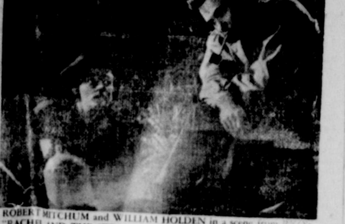
ROBERT MITCHUM and WILLIAM HOLDEN in a scene from the picture "THE STRANGER," co-starring LORETTA YOUNG.