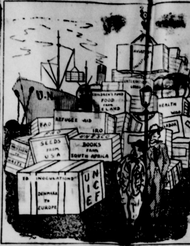
"Well, what's the United Nations Doing Anyway?"