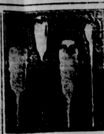
Illustrated a century of American silverplate are the new 1937 Rogers Silver patterns above.