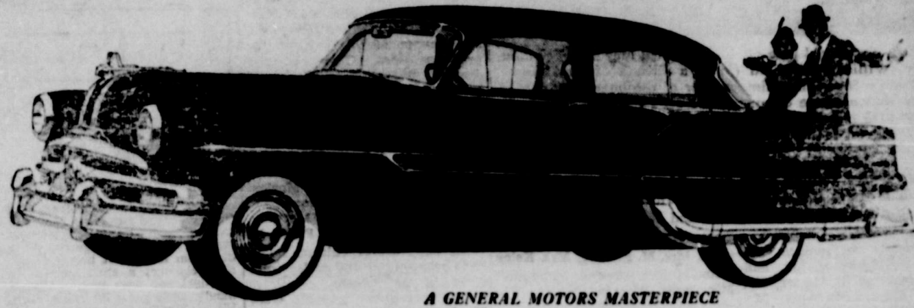
A GENERAL MOTORS MASTERPIECE