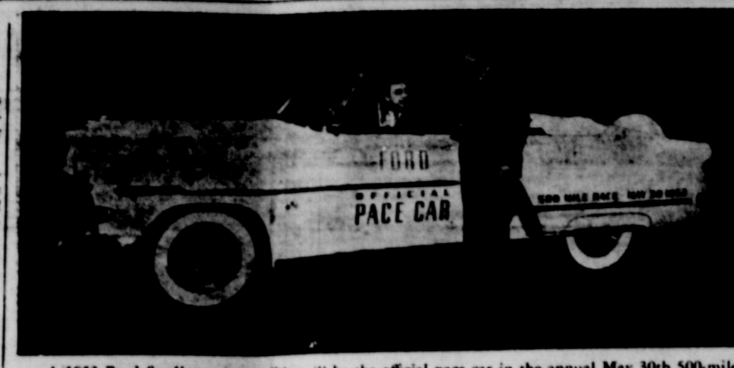
A 1933 Ford Sunliner convertible will be the official pace car in the annual May 30th 500-mile race at the Indianapolis Motor Speedway.

The Valentine theme was used throughout the shower. Games of dart throwing and hunting for the hearts were played.