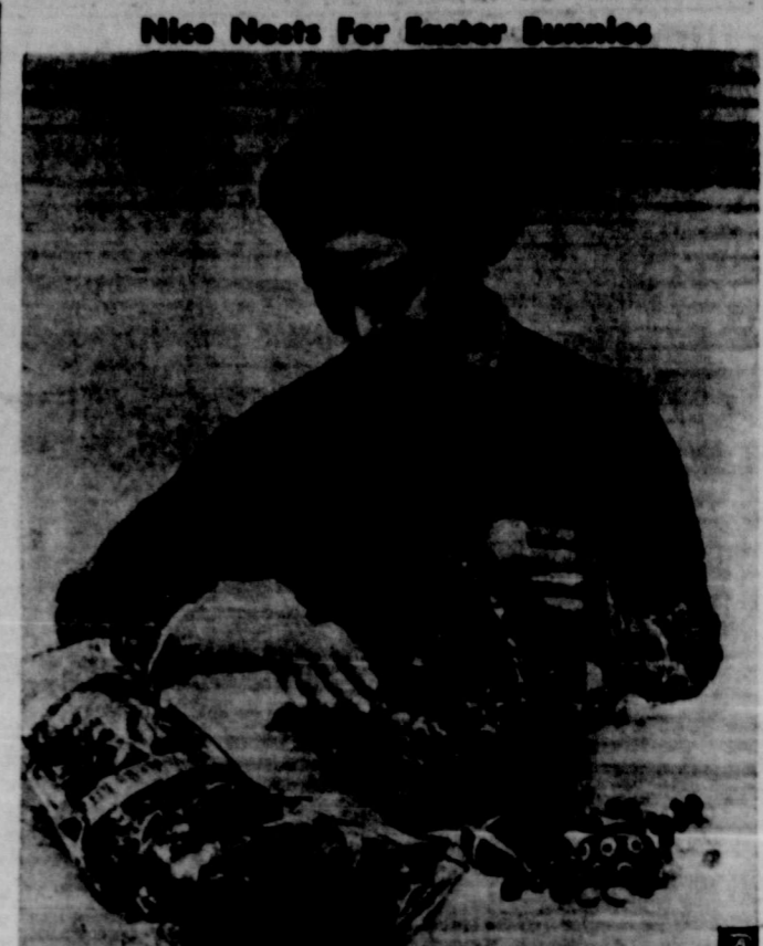
Nice Nests For Easter Bunnies New on the market this year is a handy put-up kit to make Easter baskets and decorations extra-pretty. It contains two ounces of crisp, green cellophane "straw" for nesting eggs, bunnies and toys, and a generous-sized sheet of transparent amber-colored cellophane for wrapping baskets, making party favors, and keeping Easter foods fresh and attractive—all the materials you need to make the coming of the Easter bunny a delightful occasion for young and old.