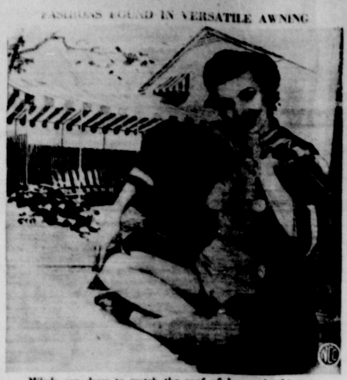
FASHION'S EQUANIMITY IN VERSATILE AWNING Milady can dress to match the roof of her patio this summer. The lounging jacket worn by this pretty miss shows how fashionable and versatile striped awning canvas can be. Many new uses are being found for canvas in and out of its traditional role of protecting homes from summer heat. This heavy, colored fabric is being widely used not only in window and patio awnings, in vertical shades, portable screens, portable shelters, outdoor draperies, backyard umbrellas, but also in feminine apparel.