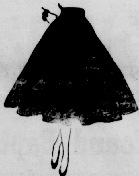
Lilly Dache . . .