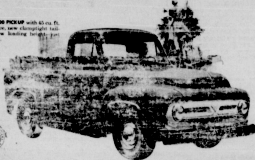
NEW F-100 PICKUP with 45 cu. ft. load space, new clamp-tight tailgate. Low loading height—just over 2 ft.

New over 190 Ford Truck models—from Pickups to 55,000 lb. G.C.W. Big Jobs! Choose the one right Ford Economy Truck for your work! New Ford "Driverized" Cab cuts driver fatigue! New curved one-piece windshield! New wider adjustable seat with counter-shock snubber! New insulation and quietness! Widest transmission choice in truck history! Synchro-Silent transmissions now standard on all models! Overdrive or FORDOMATIC Drive available in half-tonners (extra cost)! New overhead-valve V-8's and Six Plus, Truck V-8 and Big Six... 5 great engines. Only FORD Trucks offer V-8 or Six choice. New shorter turning! New set-back front axle—sharper steering angle—easier, faster maneuvering! New springs, new brakes!