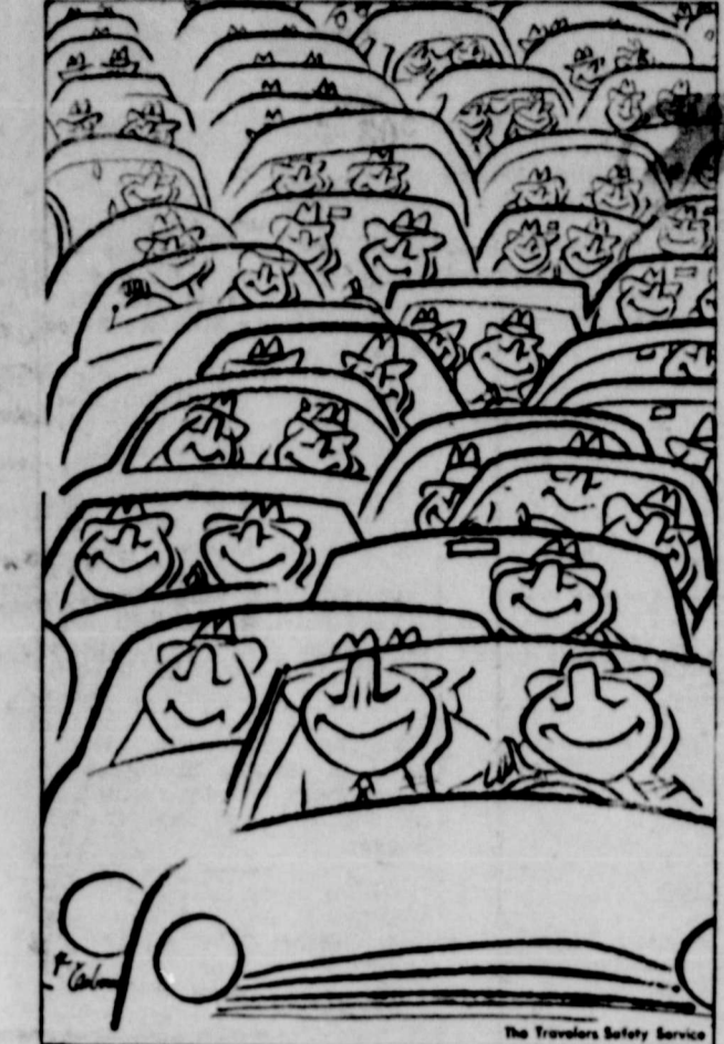
Most traffic accidents happen to drivers who think accidents are always caused by the other fellow. Remember: only YOU can prevent accident!