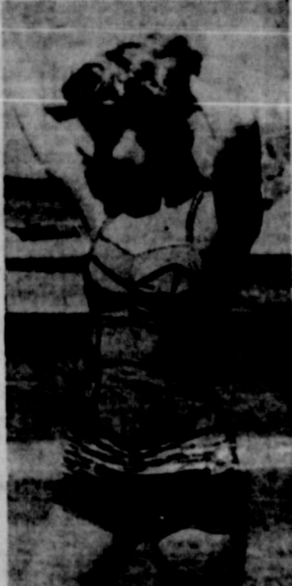
Snug, shirred torso suit of sleek Avitex rayon taffeta gives a "pared down" look. The hour glass silhouette, newest note in beach wear, is emphasized by smart contrast piping on the bodice. Softly shirred bloomer legs are kind to full hips.

Now... Borrow up to $2,500 for needed home improvements