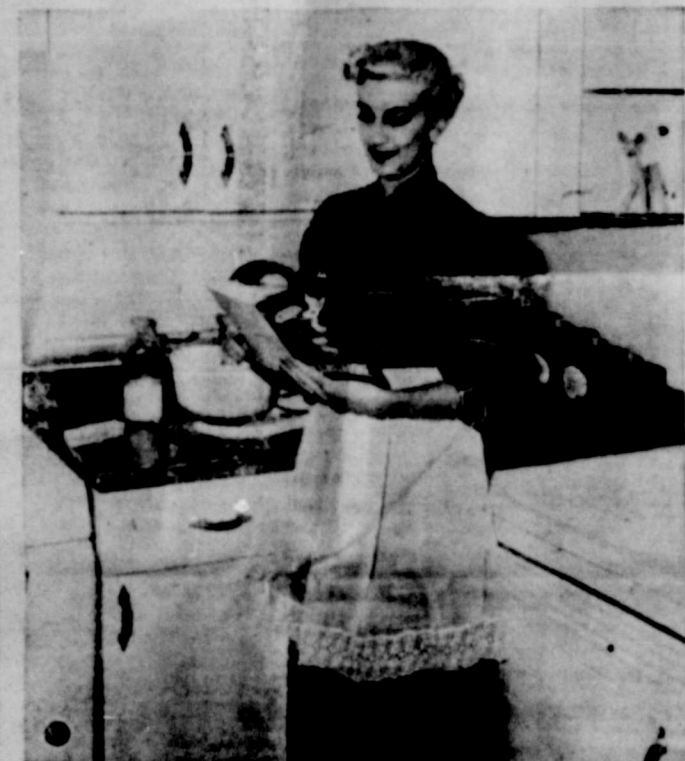
This chic young homemaker checks her "Meas Magic with Margarine" recipe booklet for detailed instructions as she prepares to make Velvety Chocolate Cake. This is an easy, quick-to-make recipe for cake. She has time to prepare it while the rest of her evening meal is cooking! Beginning today in this publication is a series of tempting recipes adopted from this margarine cook book.