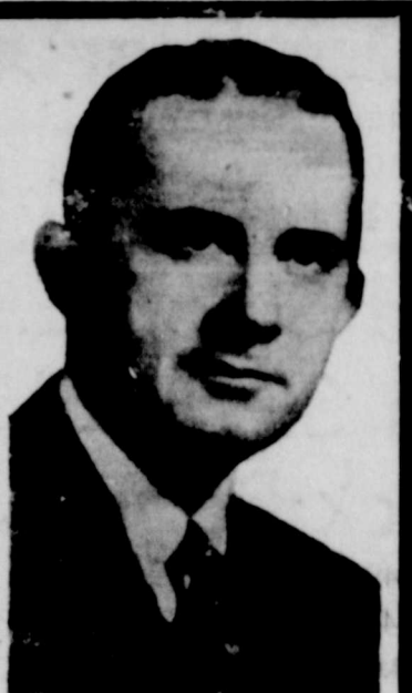
GOVERNOR ALLAN SHIVERS Election Results in Duval, Hidalgo and Travis Counties are Complete Answers to Yarborough's Charges

Ralph Yarborough charged that Governor Allan Shivers had made a deal with George Parr for the Duval County votes. The election returns, however, show that George Parr delivered his votes in Duval County to Yarborough, 3016 to 1368, thus branding as absolutely false the charge which Yarborough had made.