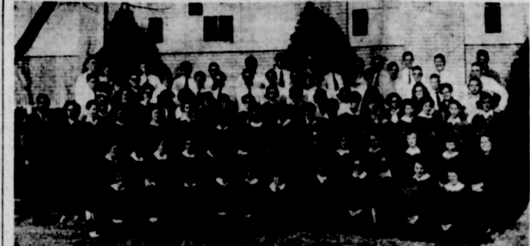
Pictured above is the Spurr High School chorus which last Thursday made a concert tour to Aspermont, Hamlin and Anson. The choir also participated in the Spring Music Festival Tuesday night, May 1.

The East Ward P. T. A. will hold its annual Summer Round-up May 11th beginning at 9 o'clock in the Primary Building. Every child who will enter school next fall for their first time needs to be present. It is necessary that each of these parents be present to help get their child's school record started correctly.