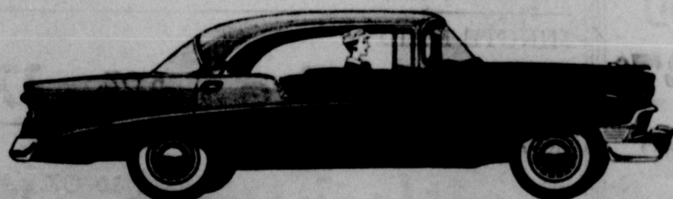
Bel Air Sport Sedan—here's your buy for the most luxury and distinction in Chevrolet's field!

And look at the model choice you've got. Twenty in all, including four hard-tops—two of them "Two-Tens." Six station wagons—three "Two-Tens" and one "One-Fifty." So even among the lower priced Chevrolets you have plenty of choice. Come in and look them over!