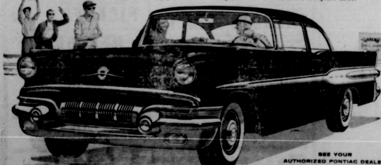
SEE YOUR AUTHORIZED PONTIAC DEALER

model Pontiac Chieftain with a 317 h.p. Strato-Streak V-8 and introducing new Tri-Power Carburetion, optional at extra cost on any Pontiac model. It's America's newest power advance—and Pontiac's alone at a price so low! See your Pontiac dealer and learn how you can drive a Pontiac—America's Number One Road Car—at prices starting below 30 models of the low-price three!