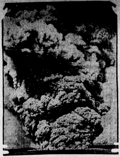
The Halemanuan pit on the Kilauea voicano in Hawaii is belching if and lava again. The first manifestation of the disturbance was a burst black smoke followed by fire and loud roaring. This picture was take during a previous outburst of the voicano.