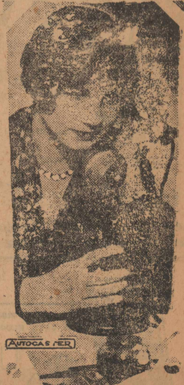
Miss Helen Wills, America's tennis queen, is now in Europe to study art but friends say she will battle Mlle. Lenglen for the world's net crown before returning to her native shores.