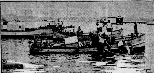
A school for training personnel in airplane "crash" rescue work has been opened at the naval air station at Washington. Particular emphasis is laid on rescues where the plane falls into the water, subjecting its occupants to the additional hazard of drowning. The photograph shows a crew simulating the rescue of the occupants of a plane which has "cracked up" and is submerged except for the tail.