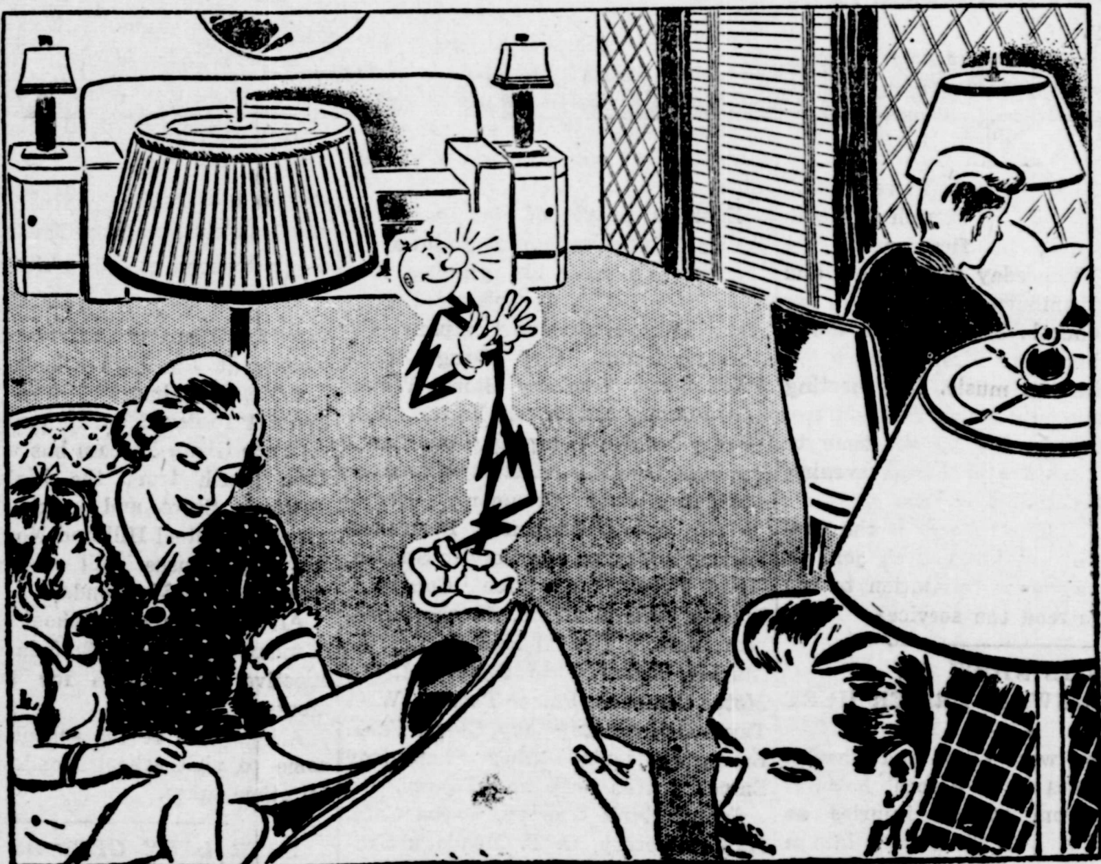
"Look at This Happy Family," says Reddy Kilowatt. "Light for All!"

"Why risk eyestrain with improper lighting? It costs so very little to protect the whole family's eyesight by Light Conditioning the home with I-E-S Better Sight lamps—thus providing the right amount and the right kind of lighting for seeing, comfort and beauty, wherever eyes are used for work or play."