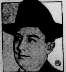
Alford (Jake) Lingle, Chicago police reporter, slain by gunmen. Chicago newspapers have offered rewards totaling $30,000 for the discovery of the murderer.