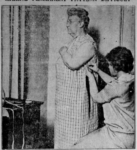
Alterations on a Foundation Pattern of Checked Gingham.

Greared by the United Bases Department. The "perfect thirty-six" fluore—or that for any other measurement—is occasionally found, but more often, after buying a pattern of any given size, adjustments and changes must be made to suit the Individual. A woman may have large hips and slender shoulders, or vice versa; extremely square or extremely sloping aboutlors; an expecially wide or narrowback; shorter or longer arms than the average; longer or thicker trunk in proportion to other measurements than the standard, or some other other defarranceristic.