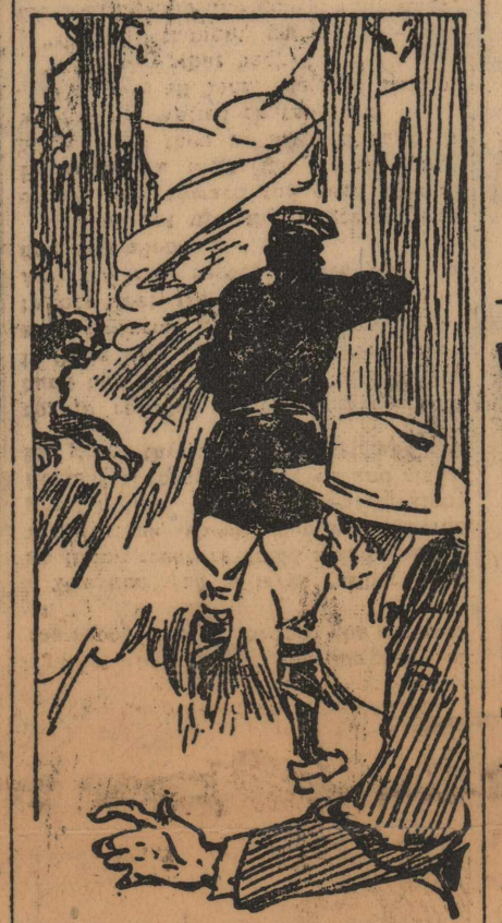
The Lead Went Straight Home.