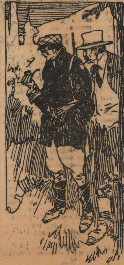
"There's Something Living in That Thicket!"

Then Dan whispered. Ever so soft a sound, but yet distinct in the si-