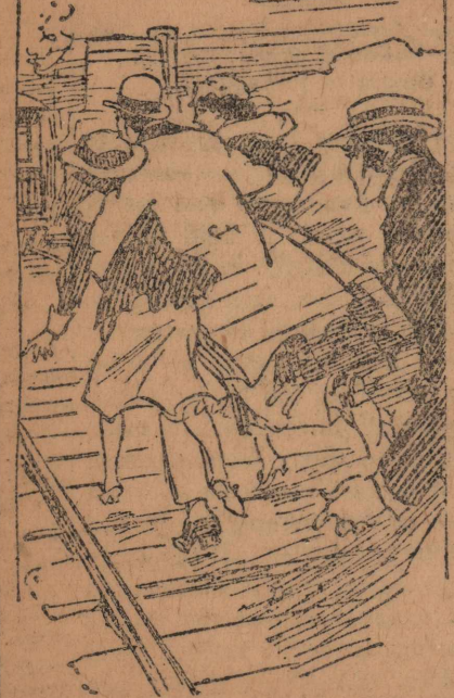
Just as if They'd Been a Couple of Sacks of Meal.

"Well," he said, in his best rusty-huge rasp, "you've done it! Why, in