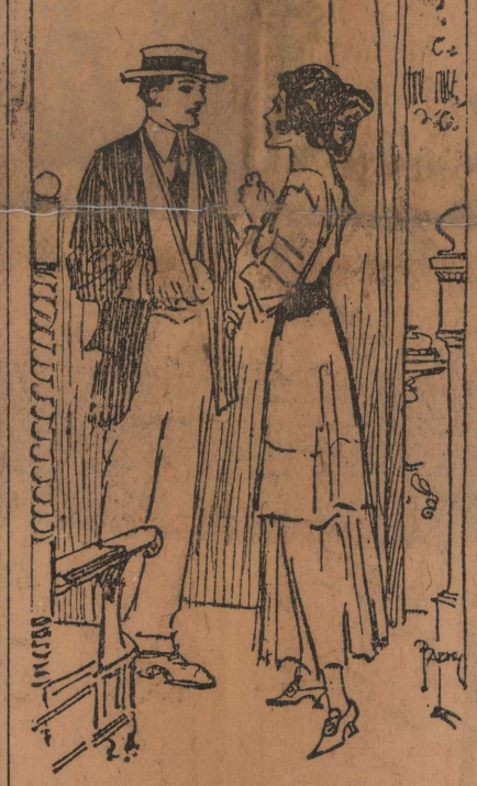
We Must Stand by Him and Defend Him."

will renew your subscription to our Society for Converting the Heathen -last year you gave a quarter."