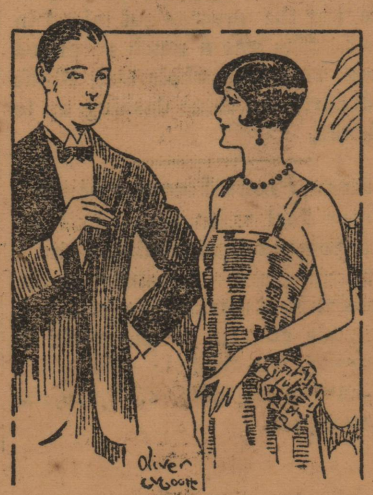
He (sadly)—There's nothing left in this land of home, sweet home. She-Oh, yes-we still have the