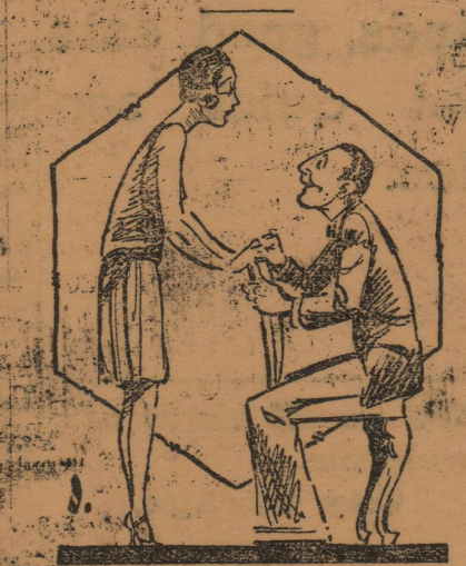
"I can't go to that dance tonight, I haven't hardly a thing to wear." "Aw shucks, cumon! You don't