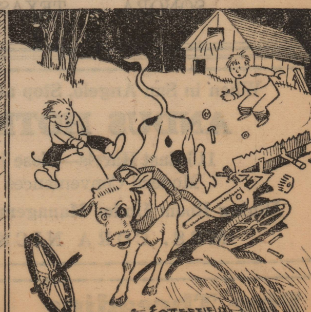
t. The future engineer constructed a mowing machin out of an old cross-cut saw, using a heifer for power.