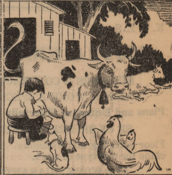
2. He was now ten years of age—old enough to assume an important share in all manner of farm work.