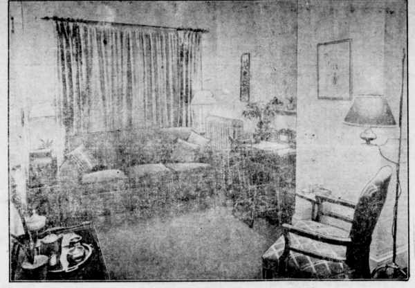
simple changes in the lighting transformed this living room from a dingy cubby-hole to the cheerful effect you see here.