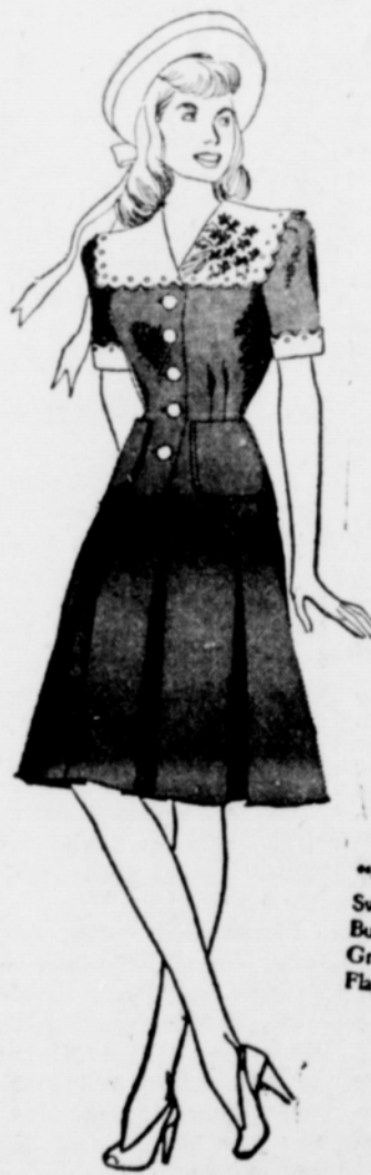
"Easter's Bonquet" Sweet Two-Piecer in Rayon Butcher Lin. In Bandana Green, American Navy, Flag Red Sizes 11 to 15, $12.95

Dresses in dark sheers, printed meshes linens and bemburges. Sizes and Styles for all types . . .