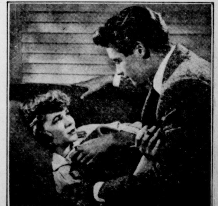
Portraying an emotionally weary war widow, lovely Dorothy McGuire stars with Guy Madison in RKO Radio's sympathetic drama of three Marines' rehabilitation, "Till The End of Time." Robert Mitchum and Bill Williams co-star with them. Plaza Sunday and Monday.