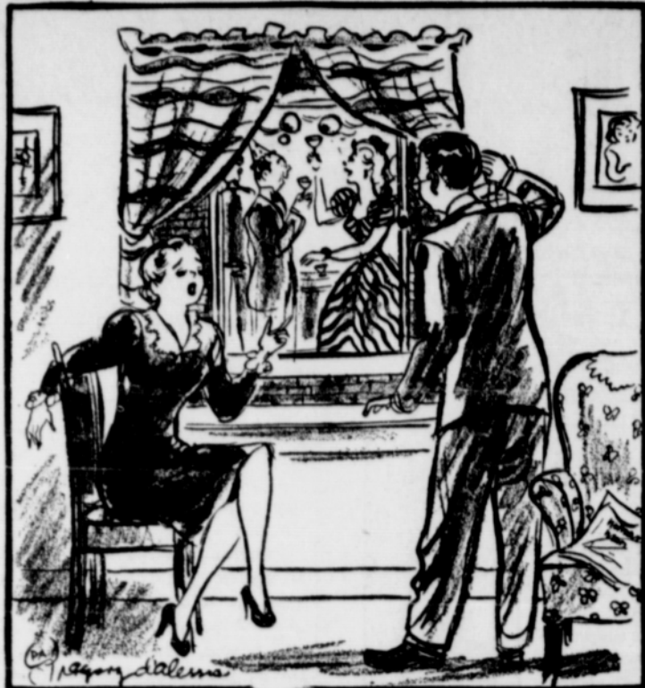
"Goodness! That's exactly like the dress I was going to wear if they had invited us. Thank heaven they DIDN'T!"