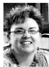
WHAT'S ON MY MIND

Increased awareness initially resulted in a higher rate of breast cancer diagnosis, but early detection has helped reduce sharply the fatality rate. From 1998