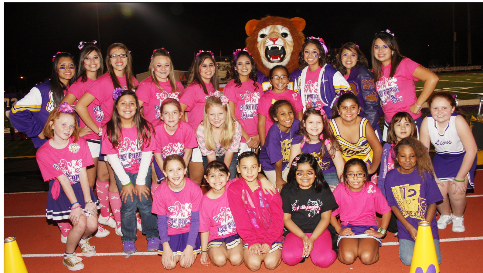
3RD - 6TH GRADE LITTLE CHEERLEADERS POSE WITH THE OHS CHEERLEADERS AT THE OZONA-MASON GAME ON OCT. 19 IN LION STADIUM.