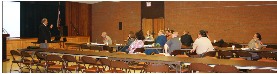
LAW ENFORCEMENT and prosecutors from West Texas attended the Texas District and County Attorneys Association Statewide DWI Training on Oct. 17 in Ozona. The training, made possible through a grant from the Texas Department of Transportation, was hosted by the 112th District Attorney's Office.