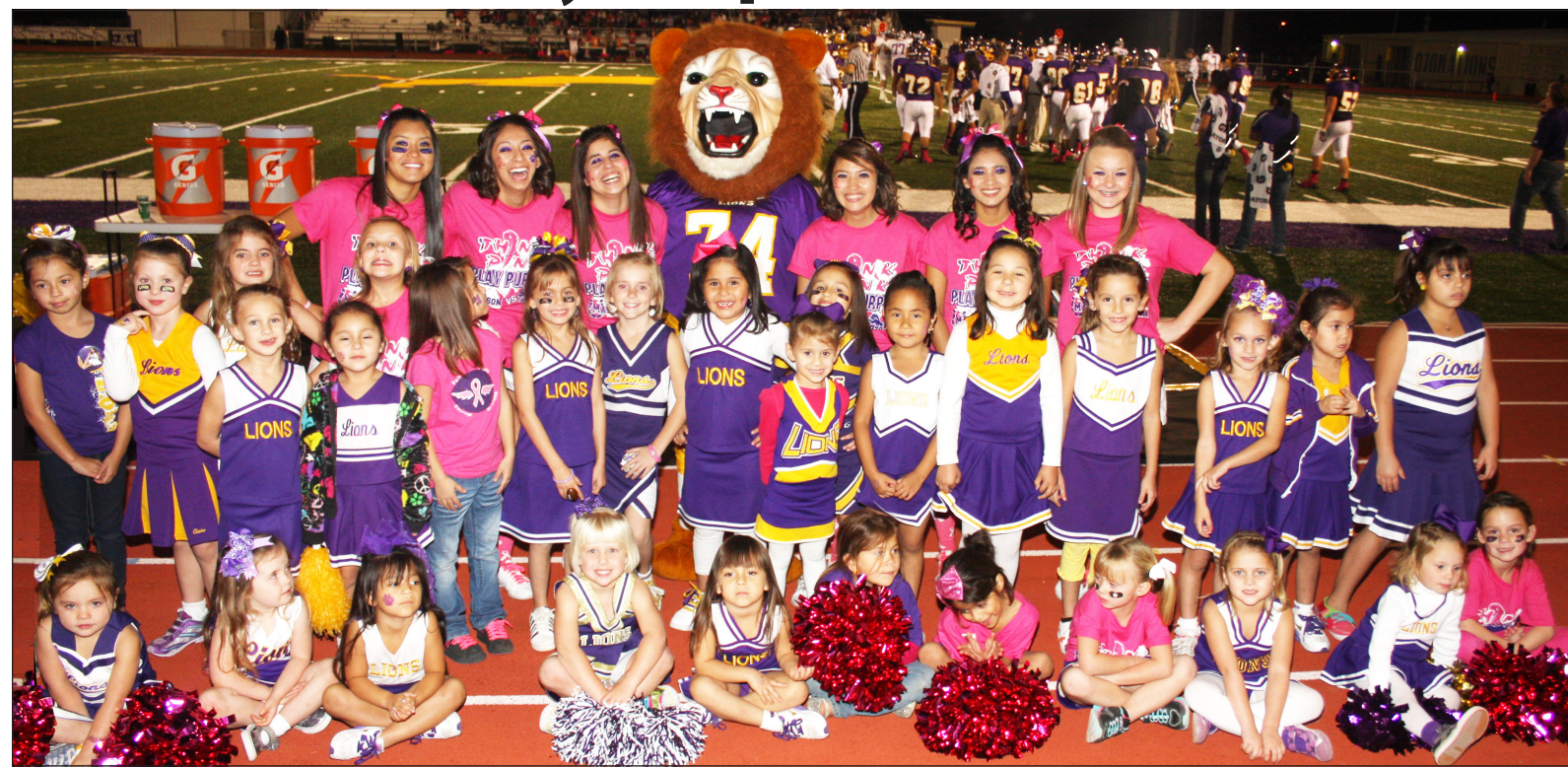
LITTLE CHEERLEADERS POSE WITH THE OHS CHEERLEADERS AT THE OZONA-MASON GAME ON OCT. 19 IN LION STADIUM.