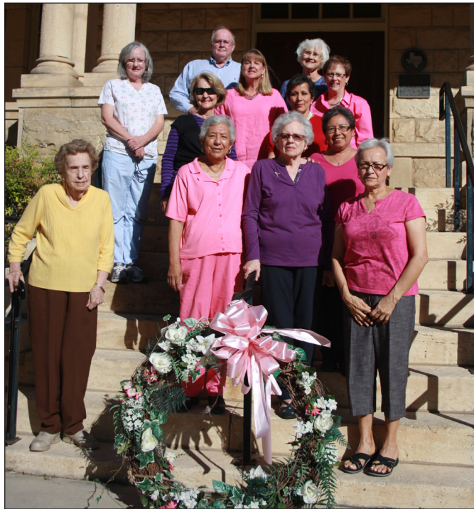
OZONA CELEBRATED BREAST CANCER AWARENESS MONTH all last week: (top left) OHS and Mason High School Cheerleaders in their "Think Pink, Play Purple" shirts that raised $4,015 for the American Cancer Society; (top right) the Pink Heals Tour of pink fire trucks stopped in Ozona last week; (bottom right) Proclamation for Breast Cancer Awareness Month (bottom left) county officials, community members and breast cancer survivors gather at the courthouse steps for the proclamation.