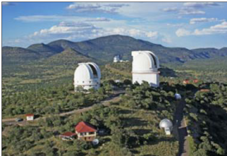
OES THIRD-GRADERS experienced McDonald Observatory on Astronomy Day on Oct. 18 through a video conference. Students learned about the sun and got to see some of the observatory located near Fort Davis.

The video conference session aligned with TEKS for grades K-12.