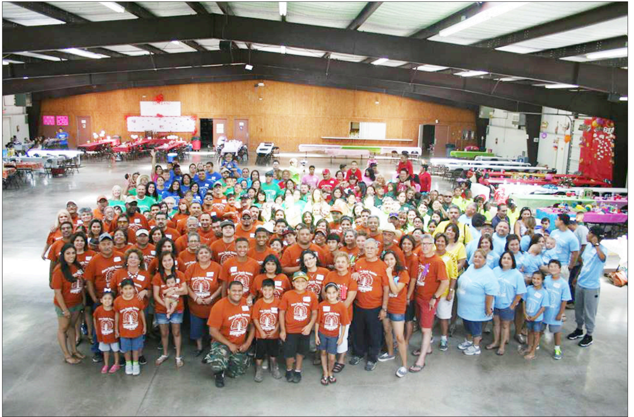
THE 2014 FIERRO FAMILY REUNION was held July 25-27 at the Crockett County Fair Park Convention Center. More than 250 family members attended.