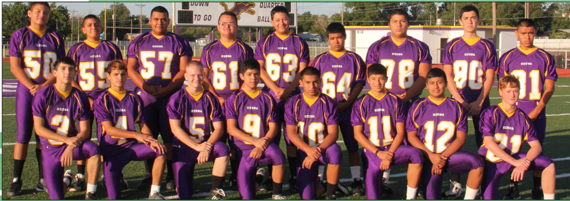
2014 JV LIONS