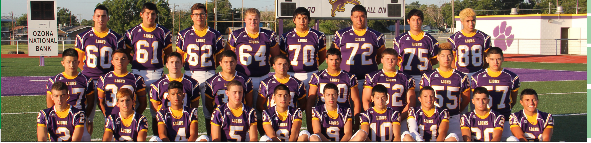
2014 OZONA LIONS