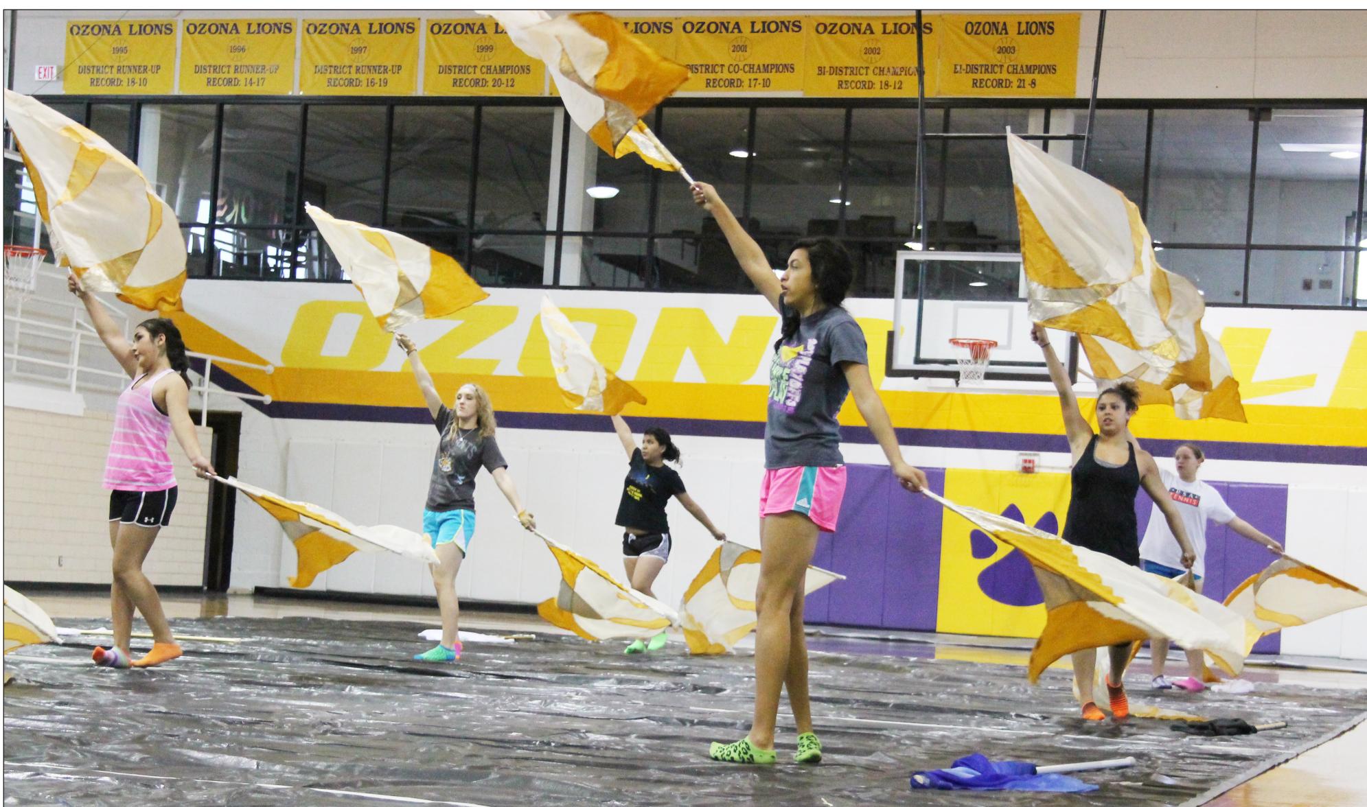
THE OHS COLOR GUARD practice their routine in the OHS Davidson Gym. This year's marching show theme is "The Hunger Games" based on the popular movies and books.