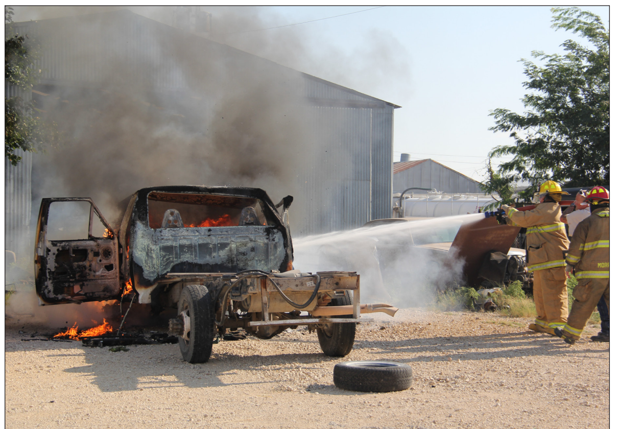
A PICKUP TRUCK CAUGHT FIRE on Aug. 6 behind the CC Wrecker building off of 11th Street. Ozone Firefighters quickly extinguished the fire. No one was injured. Firefighters pictured: Paula Ogle, Blake Morrow and Scott Carson.