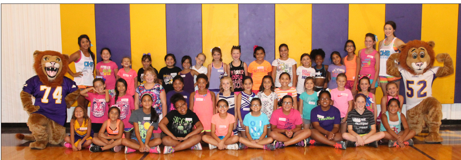
THE OHS CHEERLEADERS held their annual Lil' Cheer Camp last week at the OMS Gymnasium. The camp had more than 80 participants.