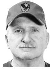
HERE'S TO YOUR HEALTH