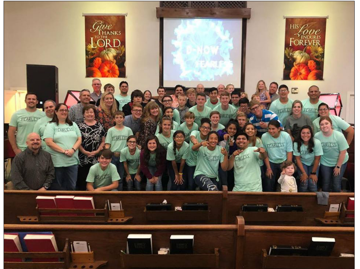
FIRST BAPTIST CHURCH OF OZONA HOSTED DISCIPLE NOW on Friday, Saturday and Sunday. The event featured 35 students in grades sixth-12th with about 20 adults.