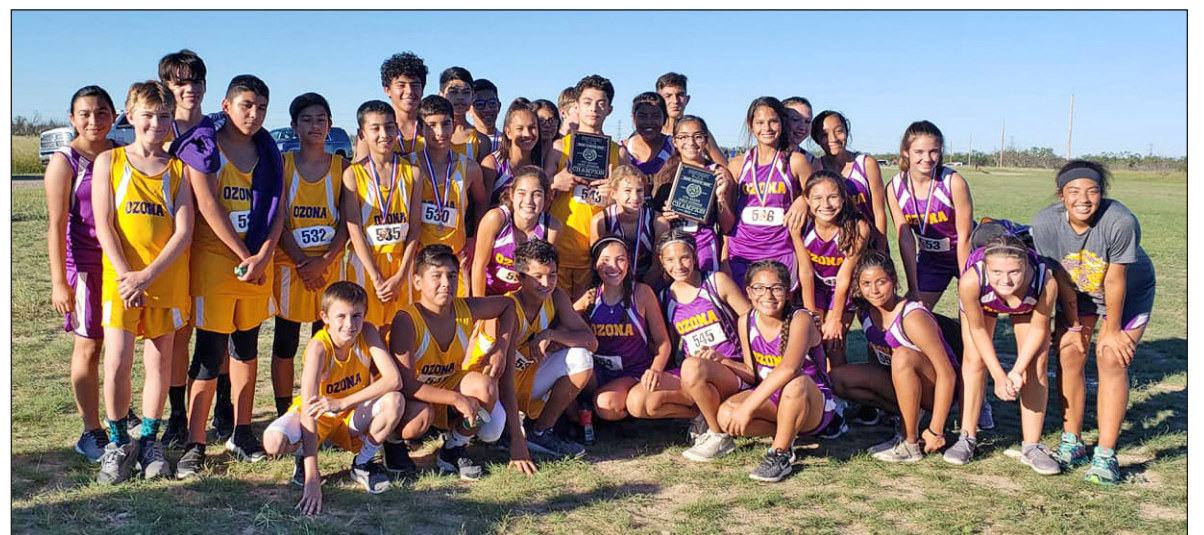
THE OMS CROSS-COUNTRY TEAMS competed at the District 7-AA Meet on Oct. 10 in San Angelo.