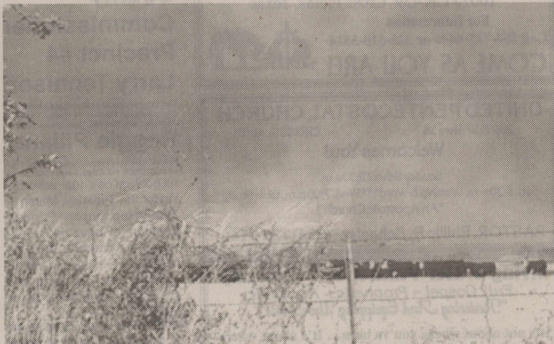
RUNNING FOR COVER —This herd of cattle try to escape the smoke and flames from a large brush fire along north State Highway 36 three miles west of Cross Plains Tuesday, December

Applications for county or precinct chairs are available now, and no fee is required.