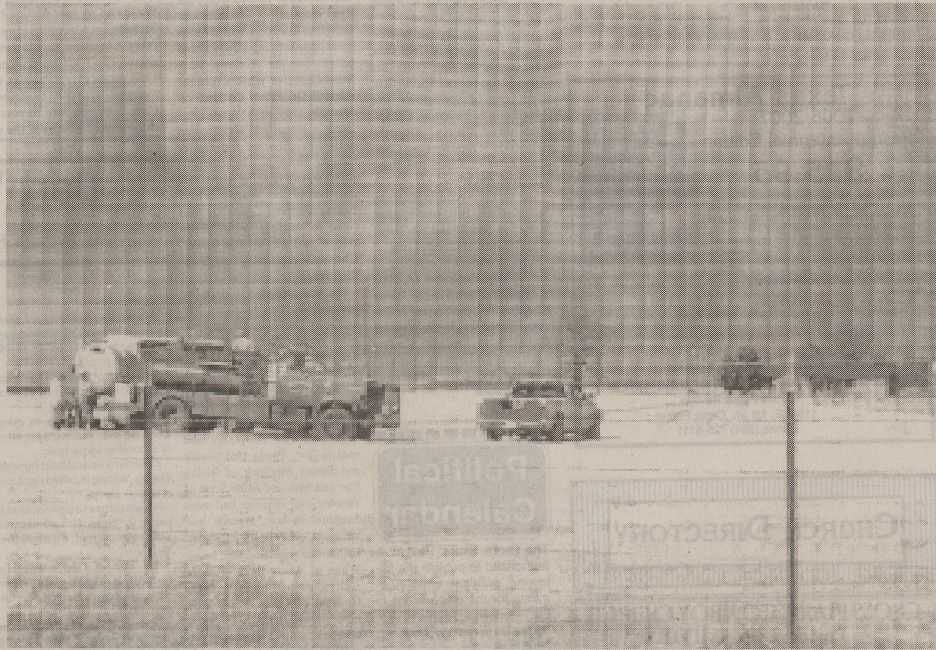
WATER TRANSFERRING —A Big Country volunteer fire truck receives a load of water Tuesday afternoon, December 27 while battling a large brush fire on State Highway 36 west of Cross Plains. The fire is believed to have started about noon in

the vicinity of the Hyatt Cattle Ranch. The fire raged throughout the afternoon with fire departments from as far away at Stephenville coming to help fight the blaze.