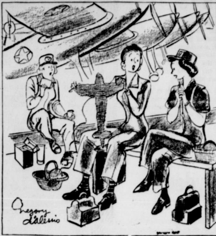
"Look! I simply haven't been able to keep my mind on my knitting since I started working here!"