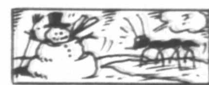
Arts can be frozen for long periods without harm. Many spend the winter inside logs and stumps, coated with ice crystals.