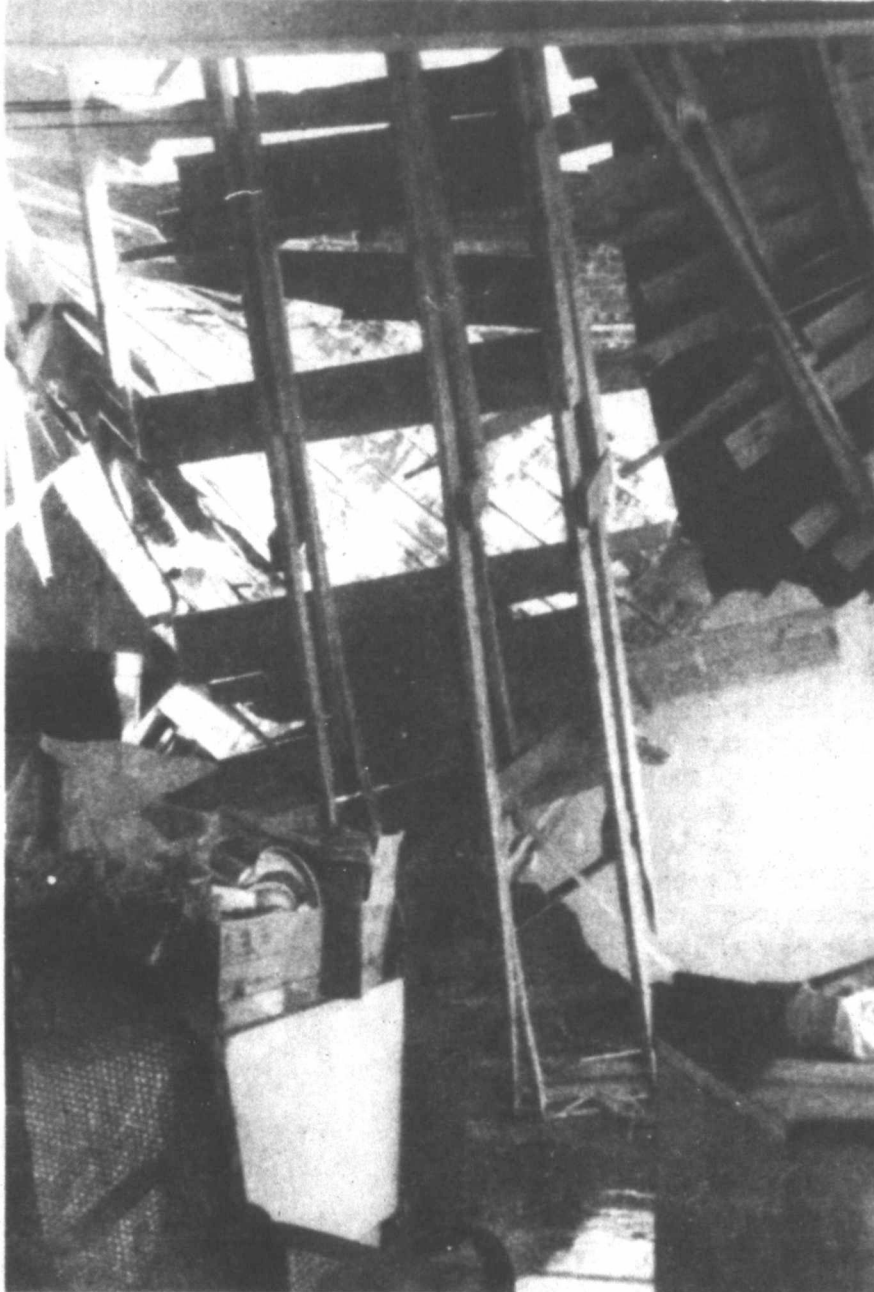
THE ROOF FELL IN —Water on the roof of the former Lankford Variety Store in Tahoka caused the roof to cave in after last week's rains. Some of the sky shows through the timbers at top.

So now I have taken care of that stack, and I can throw all that stuff away. Except for the last item, four blank sheets of paper, representative of all the constructive ideas I had last week.