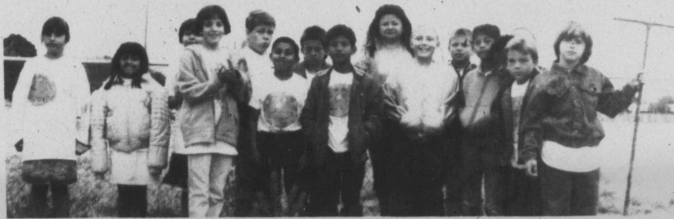
EARTH DAY ACTIVITIES —Wilson third and fourth graders planted trees for Earth Day in and around the teachers' houses.