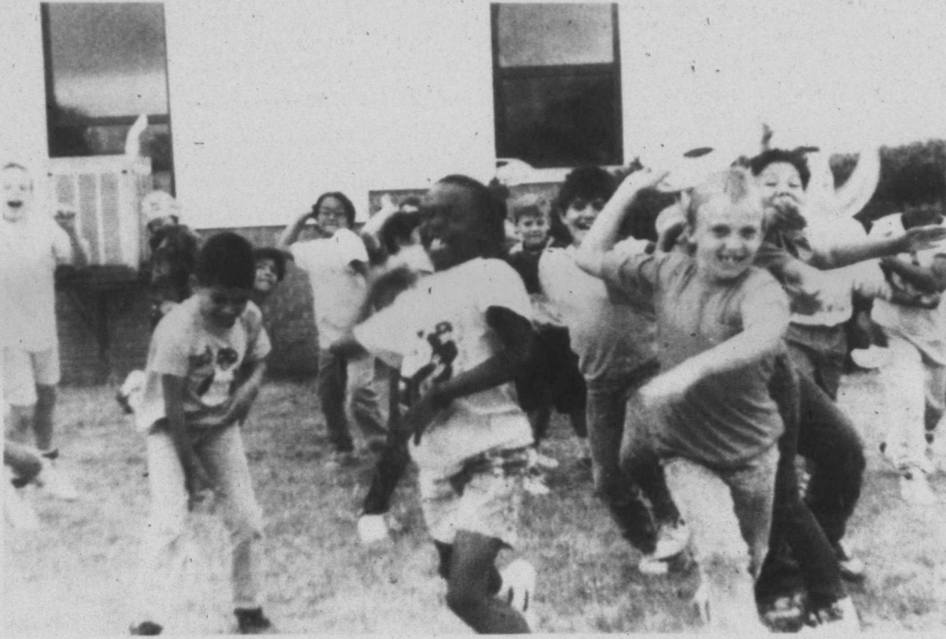
"BOOMERANG-RANG" - Third grade boys at Tahoka Elementary prepare to boomerang this photographer as she snaps this photo. Fortunately, the boomerangs were all made out of paper and the photographer escaped bodily injury. All three third grade classes are studying a unit on Australia, and constructed boomerangs which the Aborigines use for weapons and sporting events.