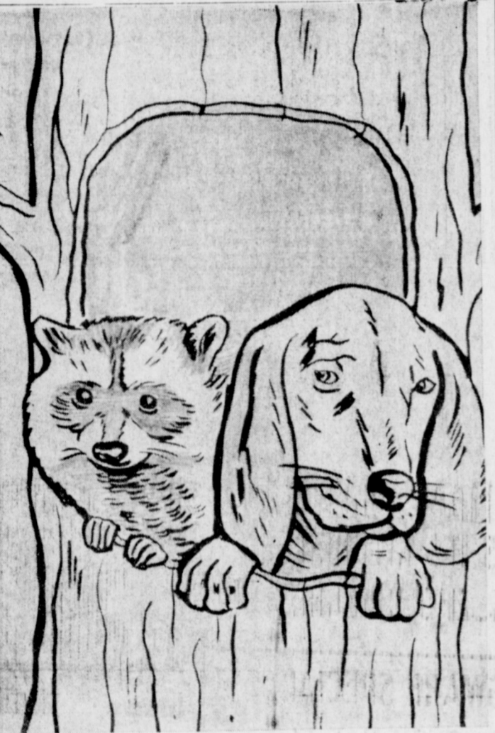
NUBBIN, the hound at the left, thinks he is a Raccoon. Walt Disney placed Nubbin with Raccoons when he was just a pup and the experiment proves amusing. The movie Disney made of the affair, "The Hound That Thought He Was A Raccoon", is showing at Moeller Theatre Sunday and Monday.

A new twist has been added to Muleshoe Dollar Day. The public may win free passes to the local movies by reading the ads of the Muleshoe merchants. If you find your name in any of the ads of the dollar day paper you are entitled to two free passes to the downtown Moeller Theatre. You may claim your two free tickets at the Journal office on Monday, Dollar Day, only. The tickets are good anytime after received, but must be picked up on Dollar Day. Aside from finding your name in a merchants ad, you are sure to find many bargains you never realized Muleshoe had to offer. We have a good group of merchants in Muleshoe who are working hard to compete with larger metropolitan towns. They will be doing a fine job too. They will continue to do so as long as we give them our support.