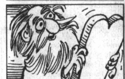
The Hebrew alphabet has 22 letters.

Students who will be new to Tahoka Elementary School will need to register at the elementary school office anytime during the week of Aug. 11-14. New students need to be registered by one of their parents or someone having legal custody of the child. Parents need to bring a copy of the child's birth certificate, Social Security card, and immunization record.