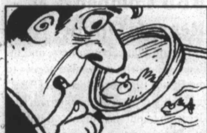
The smallest fish is the pygmy goby of the Philippines. It measures less than 1/2 inch.

An adult peacock's train contains 150 feathers.