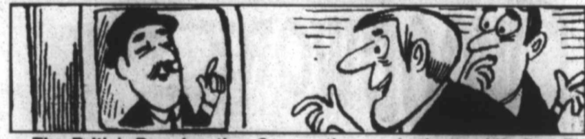
The British Broadcasting Corporation made the world's first TV broadcasts in 1936.

If you are enrolling as a new student, your immunization record will be needed. If you have questions regarding immunizations, call the school nurse at 924-7524.