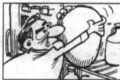
Store eggs large end up.

Available at the City-County Library, located inside the Life Enrichment Center, 1717 Main Street in Tahoka. Phone 998-4050. Open Mondays and Wednesdays, 9 a.m.-5:30 p.m. (closed 1-2 p.m. for lunch); Tuesdays and Thursdays, 2-7 p.m.; and Saturdays, 10 a.m.-1 p.m.