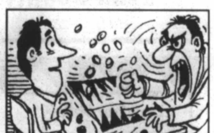
The game of backgammon is so-called from the Anglo-Saxon words baec gammon , meaning "back game."