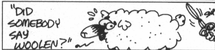
The earliest known woolen textiles date from about 6000 B.C.E.