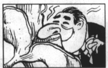
The Rafflesia, the world's largest flower, measures up to three feet across.