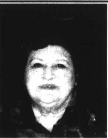
I told you I'd been good... See my halo?

The Lynn County News P.O. Box 1170, Tahoka, TX 79373