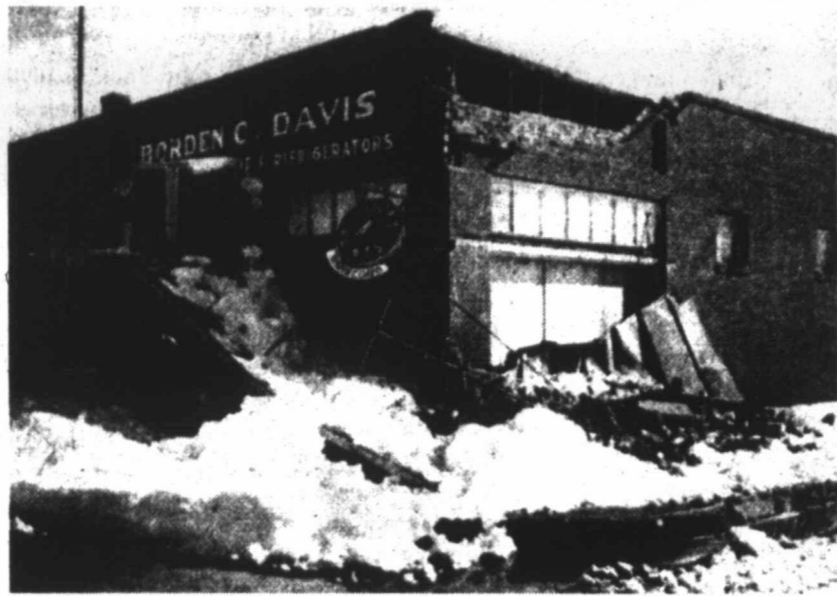
MAJOR DAMAGE resulted to the southeast front of the Borden Davis building when weight of snow piled-up caused the awning to collapse and taking a part of the brick wall with it. Only other damage reported to The News included a few leaking roofs and chug-holes in city and farm-to-market road pavement. [A 12 to 14-inch snow fell in the Tahoka area on March 15, 1969.]

The following excerpts were taken from past issues of The Lynn County News.