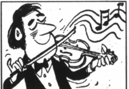
An arbesque is a lyrical musical piece in a fanciful style. The term was coined by the composer Robert Schumann.

American adventurer Jim Bowie, who fell at the Alamo in 1836, actually adopted Mexican citizenship in 1830, two years after moving to what we now know as Texas.