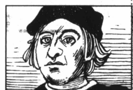
Christopher Columbus is honored on different days in different parts of the world. Columbus Day is October 12 in the U.S.

The purpose of the Lynn County SWCD, headquartered in Tahoka, is to promote sound soil and water conservation programs on farm and ranch land within the district and to serve as a voice for farmers and ranchers in conservation matters. The board coordinates the conservation efforts of various local, state, and federal agencies and other organizations and has authority to enter into working agreements with these governmental agencies and private concerns to carry its purpose.