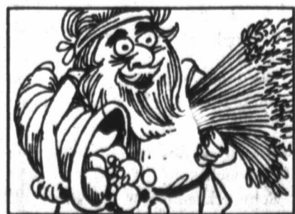
The Latin name for Saturday— Dies Saturni —honors the Roman god of the harvest, Saturn.