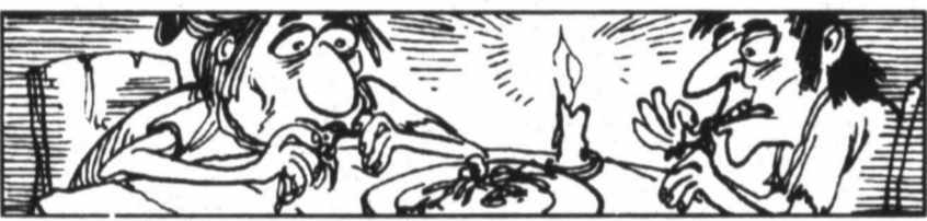
The roots of the Marsh Mallow were eaten during famines and were once used to make the candy called marshmallow.