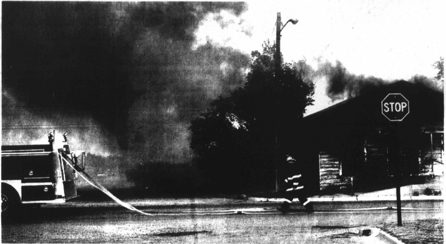
CHECKING THE HOSES - A member of the Tahoka Volunteer Fire Department hurries to check the water hose on one of the fire trucks Sunday evening as firemen battled the fiery hot blaze consuming the building at S. 3rd and Ave. J. The building was completely destroyed, but firefighters managed to keep the flames from spreading to adjacent buildings.