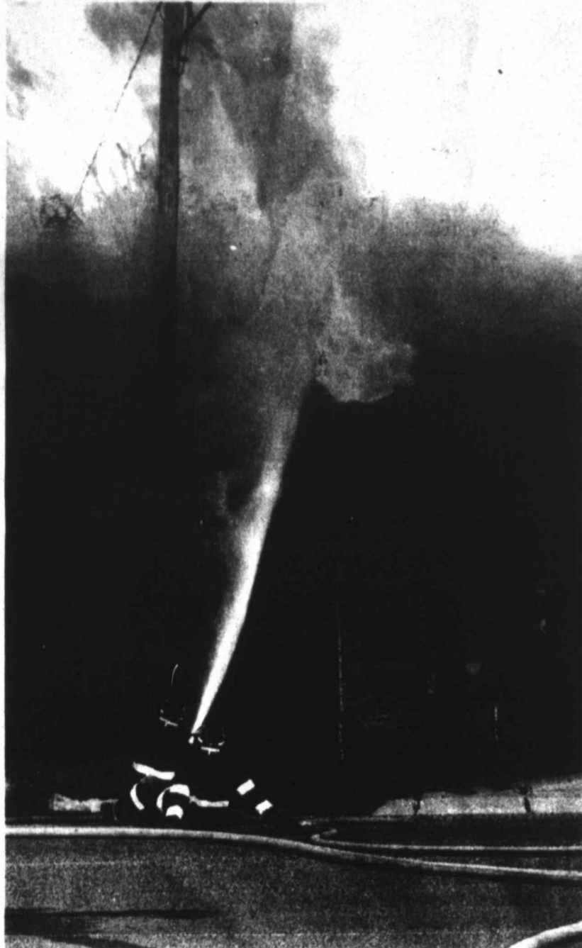
STRAIGHT SHOOTERS - Two Tahoka Volunteer Firemen keep the water hose aimed at flames shooting from a storage building in Tahoka Sunday evening. Fifteen firemen worked tirelessly for more than two hours to contain the blaze and kept it from spreading to nearby buildings on the corner of S. 3rd and Ave. J.