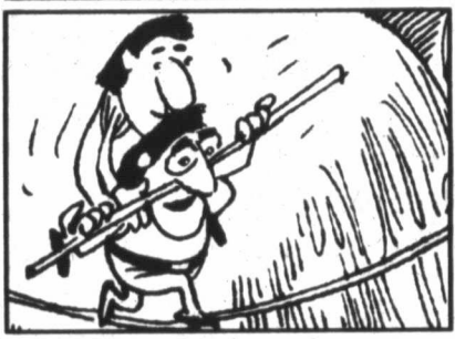
In 1859, Charles Blondin walked a tightrope 160 feet above Niagara Falls with a man on his back.